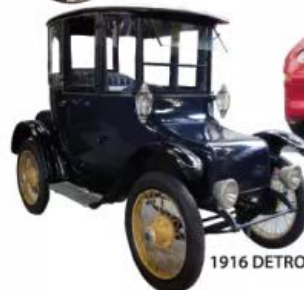
1916 DETROIT ELECTRIC