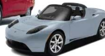
2010 TESLA ROADSTER